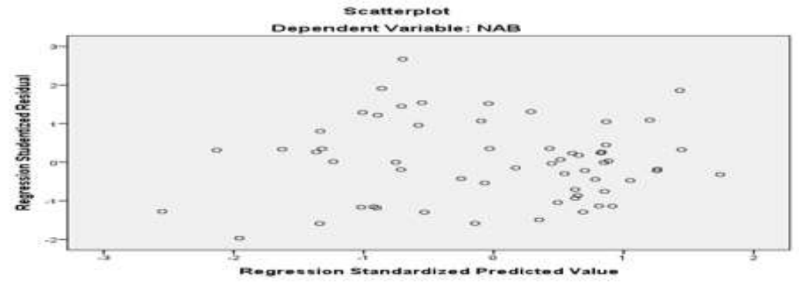
Figure 3 Heteroscedasticity Test Scatterplot Graph

In the following output, it can be seen that the points do not make a clear pattern, and also the points spread above and below the number 0 and on the Y axis, thus indicating that there is no heteroscedasticity